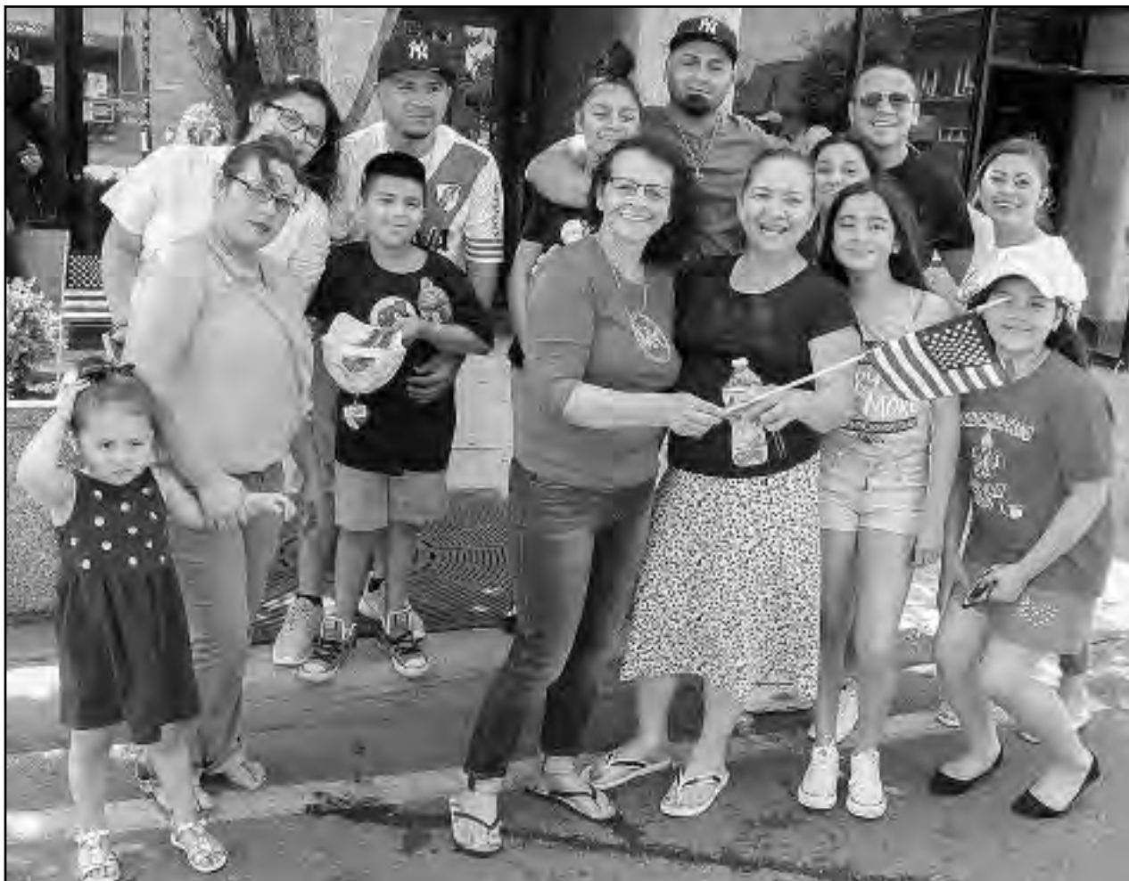
Photos from 2016 Memorial Day Parade can be found online at rennamedia.com and on the Our Town Rahway page on facebook.com . Feel free to "Like", "Tag" and "Share".

567 Park Ave • Scotch Plains njdentalcare.com