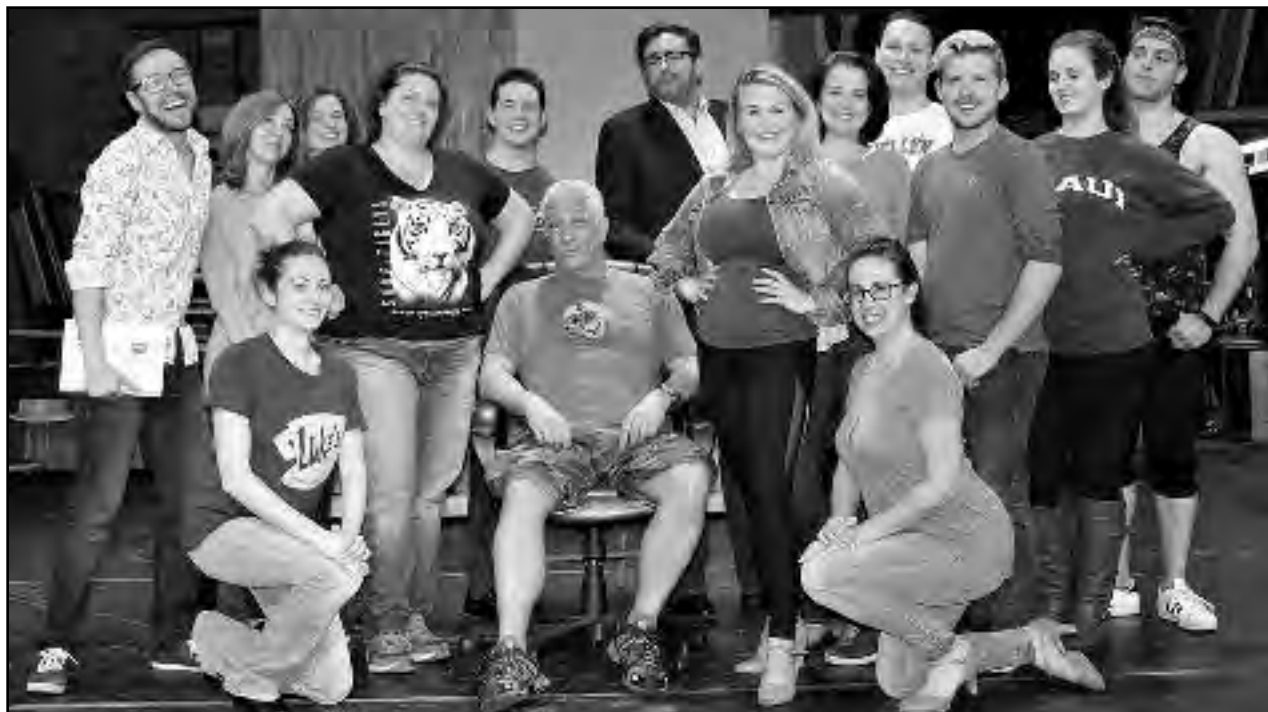
(above) The cast of 9 to 5 The Musical .