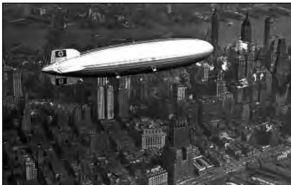
(above) The Hindenburg dwarfs the New York City skyscrapers as it flies over Manhattan on the afternoon of May 6, 1937. The massive dirigible would pass over Rahway at 3:45 p.m. on that ill fated day.

Weather predictions for the New York Metropolitan area on Thursday, May 6 called for mostly cloudy skies with the possibility of afternoon and evening showers. The Hindenburg was scheduled to arrive at Lakehurst at 5 a.m. but because of strong headwinds it was slowed down considerably and readjusted the landing time to 5 p.m. The airship passed over New York City around 3 p.m. and made its appearance over Rahway at approximately 3:45. As the craft floated overhead in the cloudy sky, car horns honked and pedestrians stopped to point and wave at what must have looked like a silver whale. A former Rahway resident recalled seeing the Hindenburg when she was a young girl after leaving a Brownie meeting