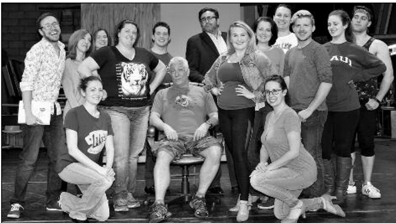
(above) The cast of 9 to 5 The Musical .

Funding has been made possible in part by the NJ State Council on the Arts, Dept. of State, a Partner Agency of the National Endowment for the Arts, through a grant administered by the Union County Office of Cultural & Heritage Affairs.