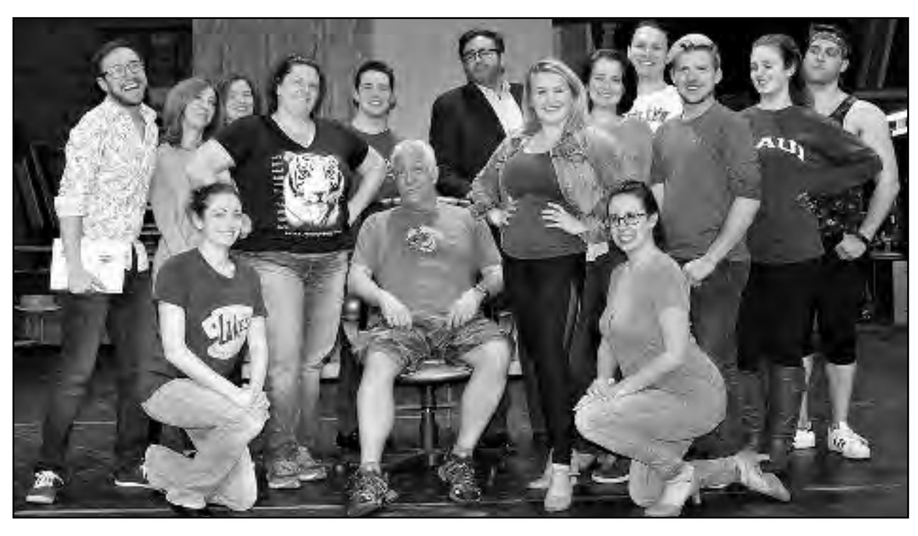
(above) The cast of 9 to 5 The Musical.

Funding has been made possible in part by the NJ State Council on the Arts, Dept. of State, a Partner Agency of the National Endowment for the Arts, through a grant administered by the Union County Office of Cultural & Heritage Affairs