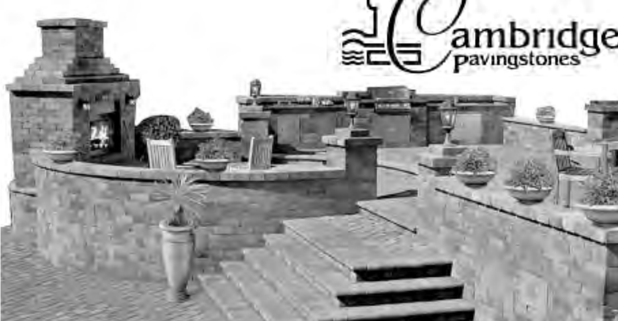
See above display and others at www.cambridgepavers.com

Largest Display of Cambridge Pavers in Union County