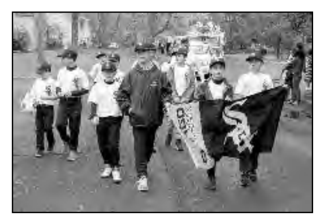
Photos from this and other events can be found online at rennamedia.com and on the Mountainside View page on facebook.com Feel free to "Like", "Tag" and "Share"