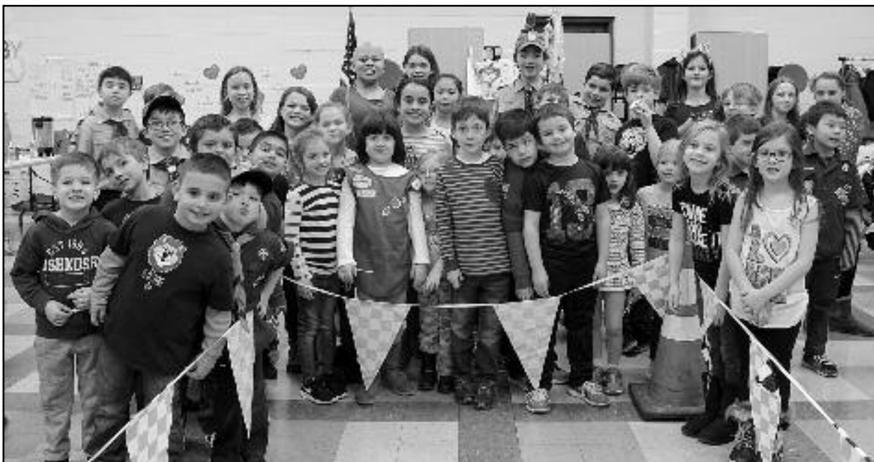
(above) Cub Scouts Pack 129 invited Girl Scouts troops from Green Brook and Dunellen to participate in the 2017 Pinewood Derby