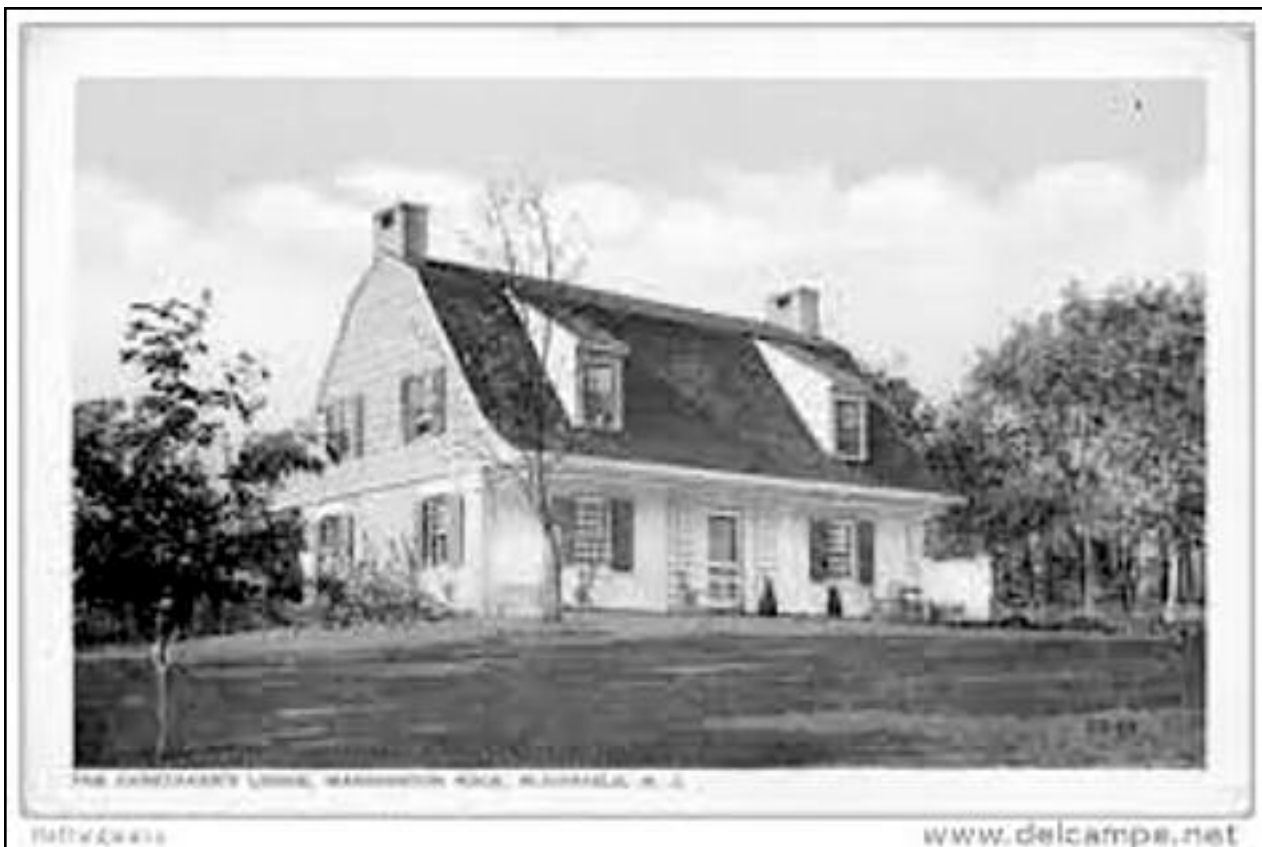
(above) Caretakers Lodge.

The Green Brook Cultural Heritage and Historic Preservation Committee and The Green Brook Historical Society meet the third Thursday of each month at 7:30 p.m. at Green Brook Town Hall located at 111 Greenbrook Rd., Green Brook, NJ. We are always looking for people interested in history and culture to join our group, as a guest or a member. For more information about the Green Brook Historical Society, visit www.gbhsnj.org .