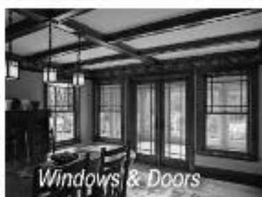
Windows & Doors