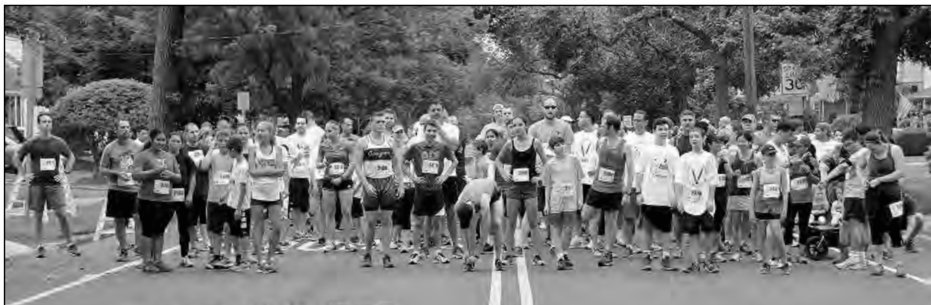
(above) CVG Velocity 5K 2016: Runners get ready at the starting line for Centennial Village Group's 2015 Velocity 5K Race. This year's race is Sunday, June 4, at 9 a.m. starting in front of Lincoln School on Centennial Avenue in Cranford, NJ.

For more information about the Centennial Village and the group, visit www.facebook.com/CentennialVillageGroup .