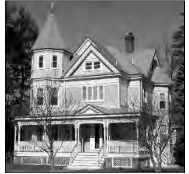
(above) Restored 203 Holly Street.

structures, education of the public as to the value of preservation, and advice to the Township on laws and activities impacting preservation. You can find more information on HPAB at www.preservcranford.com .