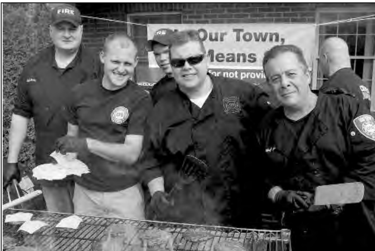
Photos from the 2016 Town-wide Cookout event can be found on line at rennamedia.com and on the Cranford Monthly page on facebook.com Feel free to "Like", "Tag" and "Share".

The Cranford Municipal Alliance Committee is a community-based organization consisting of volunteer members which is dedicated to a comprehensive and coordinated effort to reduce and prevent substance abuse. It is a local division of the New Jersey Governor's Council on Alcoholism and Drug Abuse (GCADA).