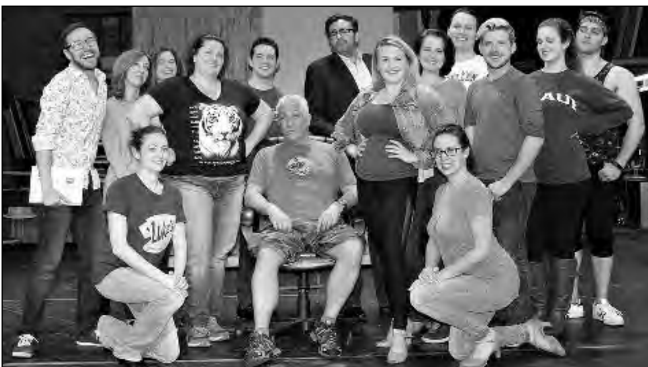
(above) The cast of 9 to 5 The Musical.

Funding has been made possible in part by the NJ State Council on the Arts, Dept. of State, a Partner Agency of the National Endowment for the Arts, through a grant administered by the Union County Office of Cultural & Heritage Affairs