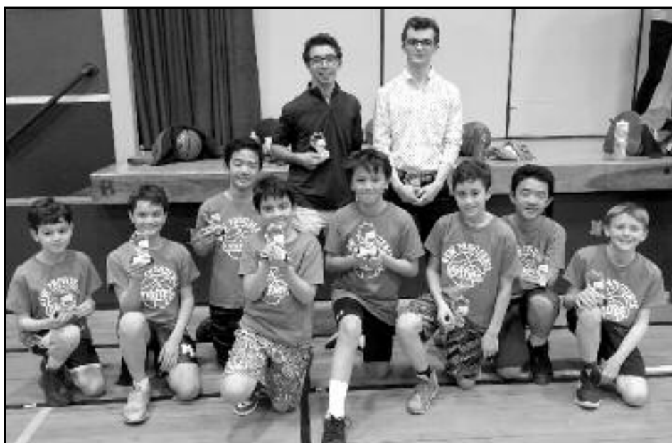
(above) 5th & 6th Celtics.