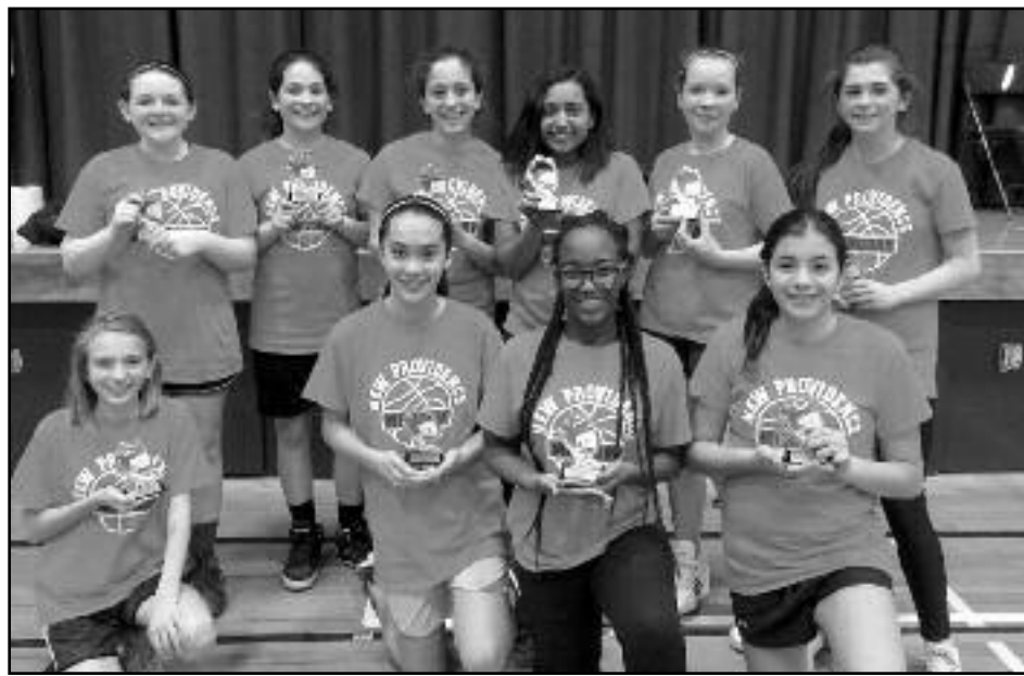
(above) 7th & 8th Mercury.