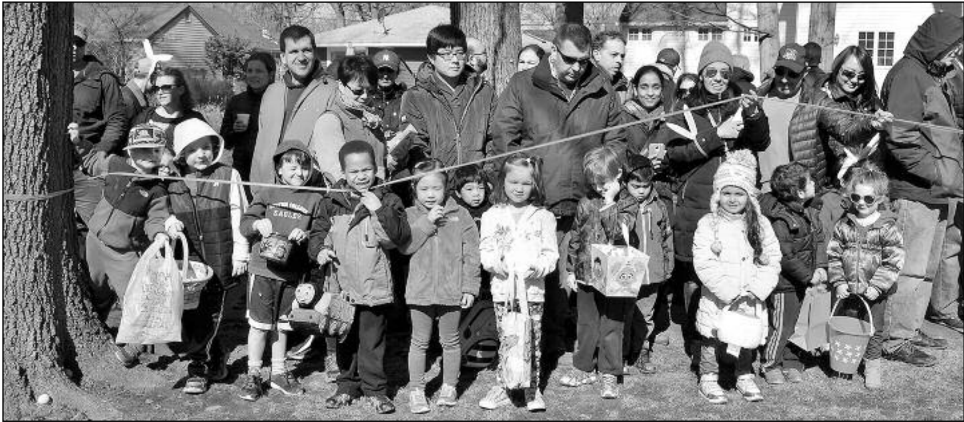
(above) Children eagerly awaiting the start of the Easter Egg hunt.