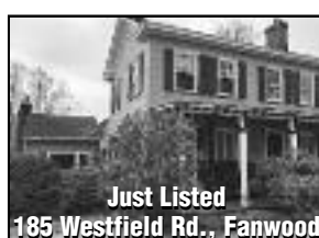
Just Listed 185 Westfield Rd., Fanwood