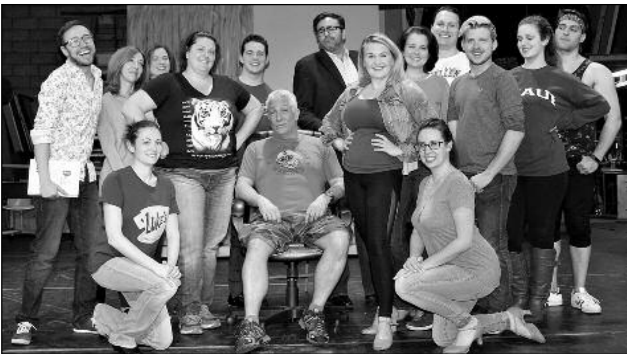
(above) The cast of 9 to 5 The Musical .

Funding has been made possible in part by the NJ State Council on the Arts, Dept. of State, a Partner Agency of the National Endowment for the Arts, through a grant administered by the Union County Office of Cultural & Heritage Affairs