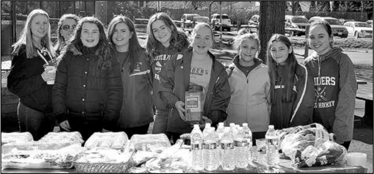
(above) Members of the Scotch Plains Fanwood High School Field Hockey team selling water and baked goods to residents.

ages to collect. Photos with the Easter Bunny, contests and games were also available to those who attended the event which was sponsored by the Fanwood Recreation Commission.