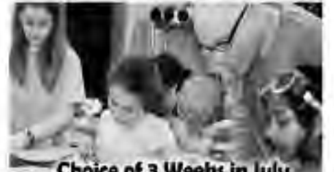
Choice of 3 Weeks in July

Use This Coupon $25.00 OFF SUMMER ART CAMP