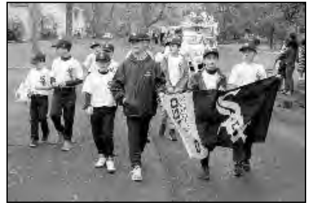
Photos from this and other events can be found online at rennamedia.com and on the Mountainside View page on facebook.com Feel free to “Like”, “Tag” and “Share”