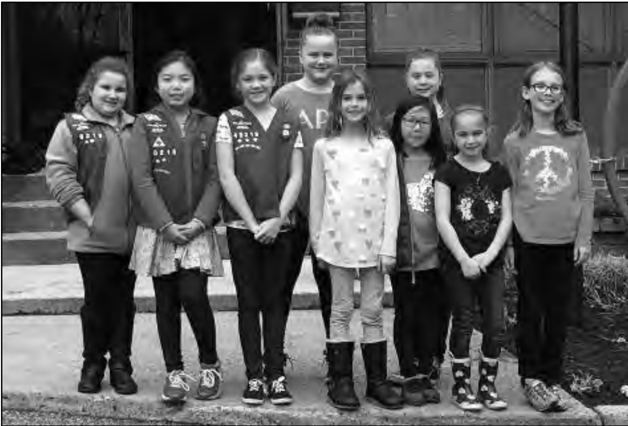
(above) Mountainside Girl Scout Troop 40812 planted flowers in front of the Mountainside Fire Department.