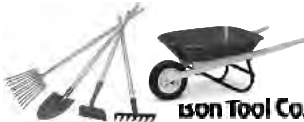
ISON Tool Co.