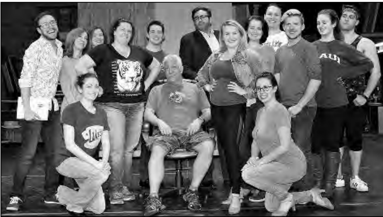
(above) The cast of 9 to 5 The Musical.

Funding has been made possible in part by the NJ State Council on the Arts, Dept. of State, a Partner Agency of the National Endowment for the Arts, through a grant administered by the Union County Office of Cultural & Heritage Affairs