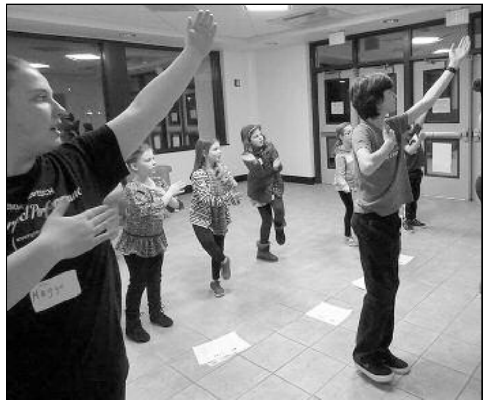
(above) Educational Outreach Team and the cast of Mary Poppins held a theatre workshop for about 50 Summit elementary students last week.

PRSR STD U.S. POSTAGE PAID PHILA PA 191 PERMIT NO. 7575