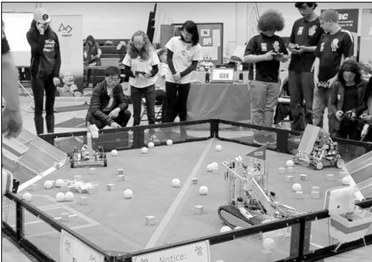
(above) Excitement built during qualifying rounds.