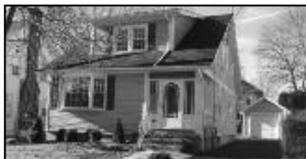
Cranford - SOLD