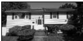
CLARK $549,900 BEAUTIFUL BI-LEVEL ON A WONDERFUL STREET IN THE DESIRABLE TOWN OF CLARK.