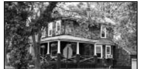
Rahway - SOLD