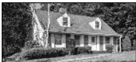
Clark - SOLD