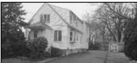
Clark - SALE PENDING