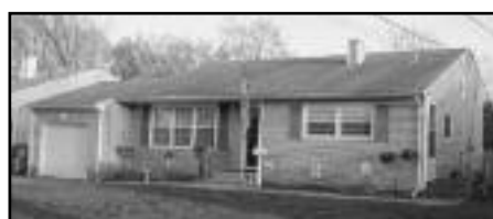
Colonia - SOLD