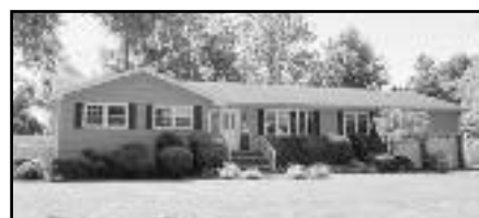
Clark - SOLD