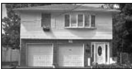
Rahway - $279,500