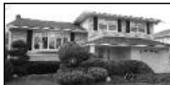
CLARK $539,000 SITUATED IN ONE OF THE MOST DESIRABLE AREAS OF CLARK!