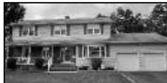
CLARK $519,000 LOVELY & SPACIOUS BEST DESCRIBES THIS CUSTOM CENTER HALL COLONIAL.