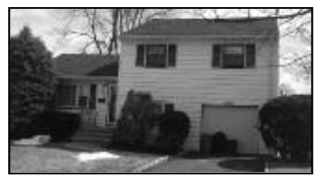
Clark - SOLD