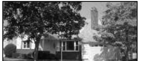
Linden - $359,000