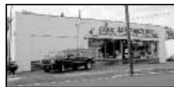
WESTFIELD $899,000 COMMERCIAL BUILDING FOR SALE. ALSO BUILDING IN BACK RENTED OUT HAS 4 LIFTS W/OFFICE