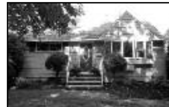
CLARK $399,000 IMMACULATE EXPANDED CAPE ON A LOVELY STREET IN AN EXCEPTIONAL TOWN!