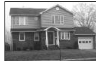
CLARK $449,000 THIS HOME IS HUGE! RENOVATED & EXPANDED IN THE LAST YEAR.