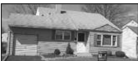
Colonia - SOLD