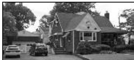
Rahway - 2 Family