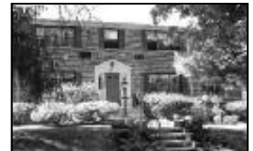
WESTFIELD $179,300 LOVELY 2ND FLOOR UNIT WITH 2 BEDROOMS.