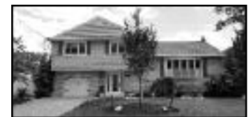
CLARK $649,900 MAGNIFICENT HOME COMPLETELY REMODELED WITH THE BEST OF EVERYTHING!