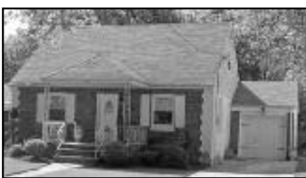
Rahway - $249,700