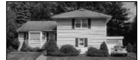
Cranford - SOLD