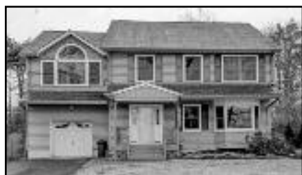
Clark - SOLD