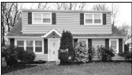
Edison - SOLD