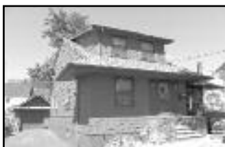
CLARK $325,000 AMAZINGLY SPACIOUS CUSTOM CAPE SITUATED IN THE DESIRABLE TOWN OF CLARK!