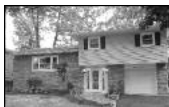
CLARK $469,900 ABSOLUTELY BEAUTIFUL! TOTALLY RENOVATED NEW KITCHEN