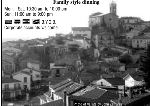
Photo of Vallata