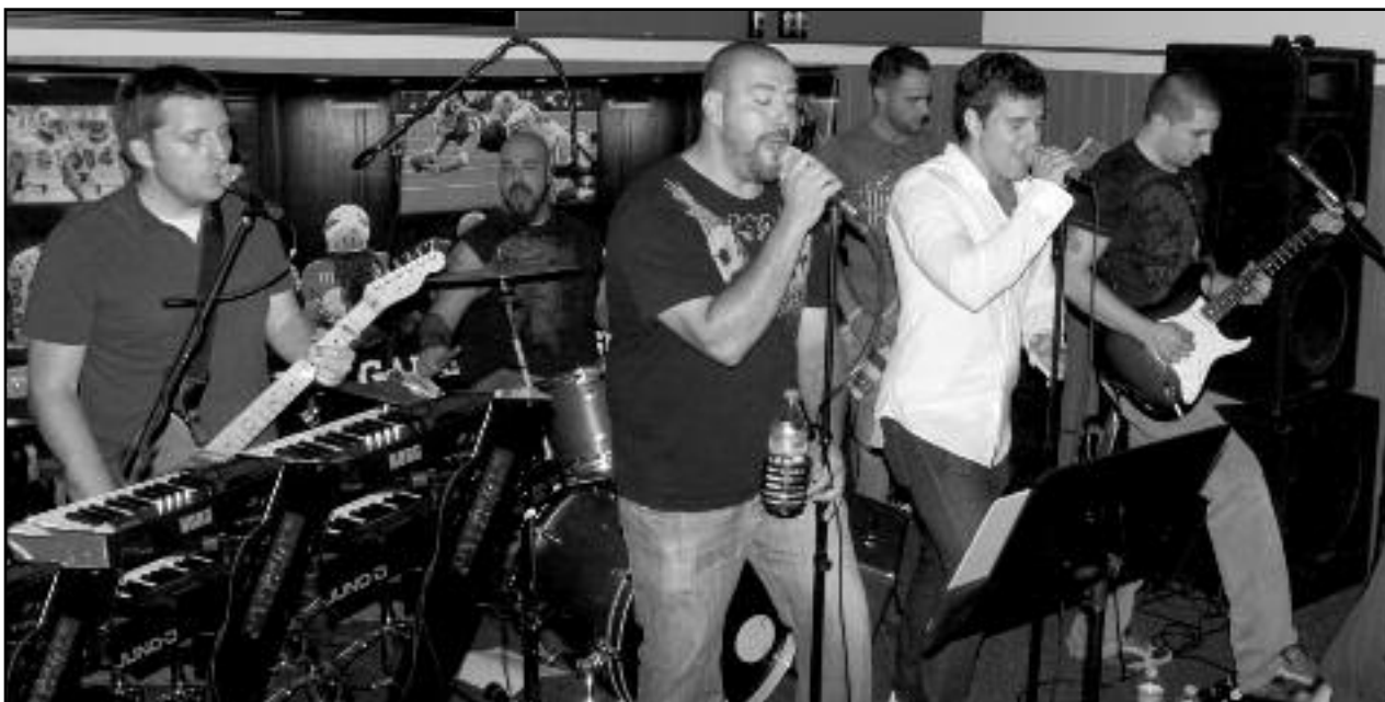
(above) Local band Punch Bully performed for free at Señorita's Hurricane Irene relief event.