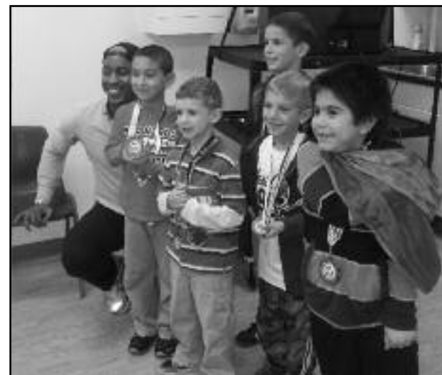
(above) Students in the Making Magic Class celebrated by performing a magic trick in front of an audience and then each child was awarded a medal of honor.