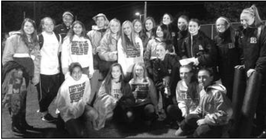
(above) The Lady Cougar soccer team of Carl H. Kumpf Middle School and the Rutgers Women's Soccer team pose together after the game.