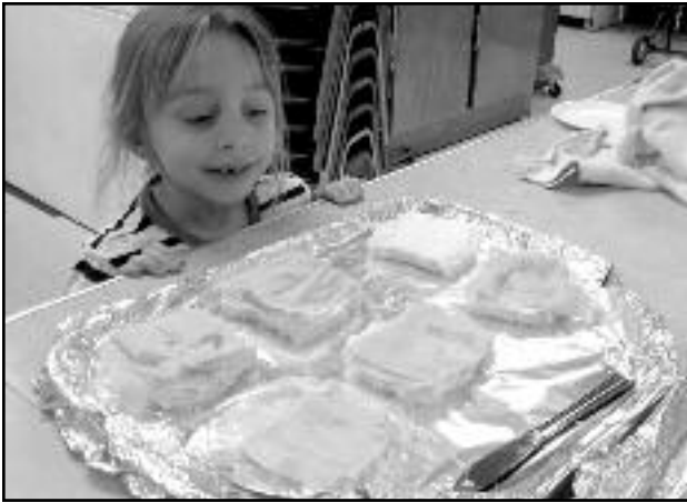
(above) A little Chef proudly looks at her creation learned at the Cooking 4 Kids class taught once a week at Clark Recreation.