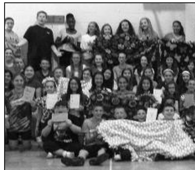
(above) Kumpf students show off some of the blankets and cards they made to donate to the hospitals for pediatric cancer patients.