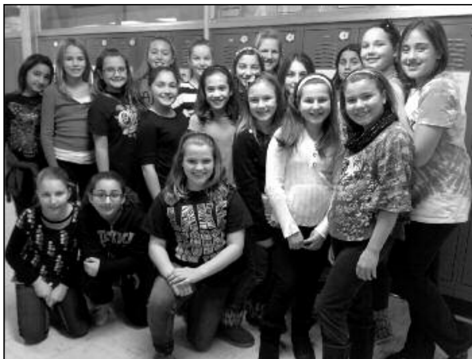
(above) Half of the 5th grade "Girls Circle" members gathered in the hallway at Frank K. Hehnlly School.