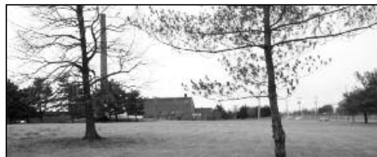
(above) Clark Business Administrator discussed the status of the 28 acre Gypsum property at the January Chamber meeting and answered questions from local businesses.